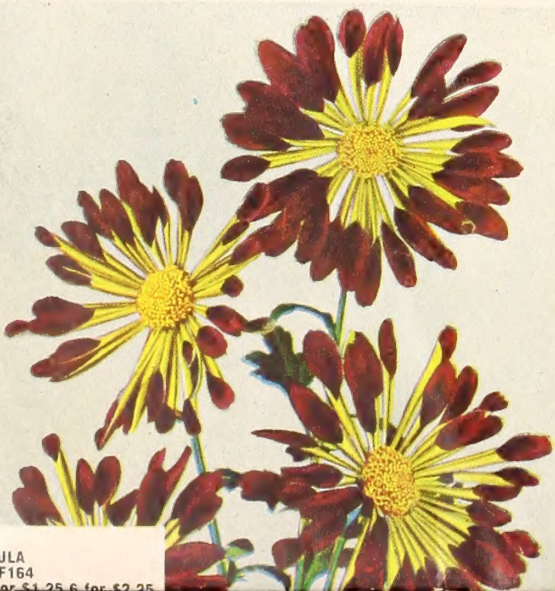
PAULA NCF164 3 for $1.25 6 for $2.25

13 Coll. No. 10B $4 25 ($5.40 Value) ONLY